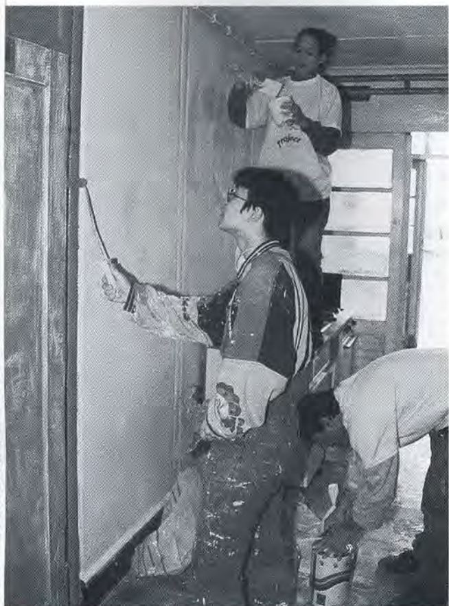
RYS participants painting the halls—part of the restoration work done on the residents' apartments.