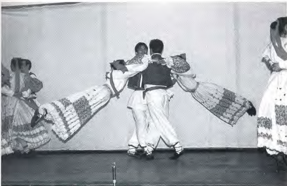
Croatian dancers at the entertainment.

Upon finishing our work portion of the project, the RYS participants concluded with a more reflective time. The organizers discovered a fishing resort area called Trakoscan which was, in many