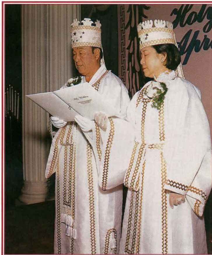
Father reads the official declaration of the blessing, as Mother listens.