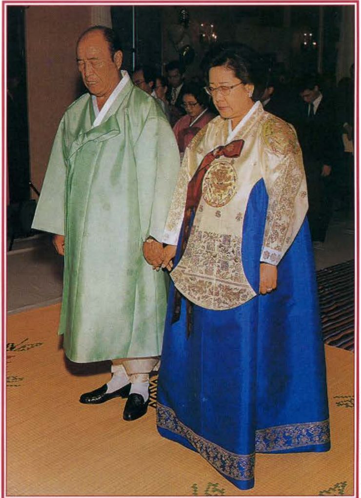
Father and Mother lead the gathering in prayer before the peh baek ceremony begins.