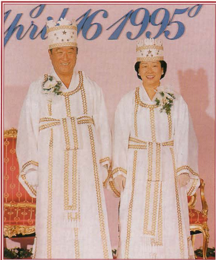
Father and Mother pose for an official portrait.