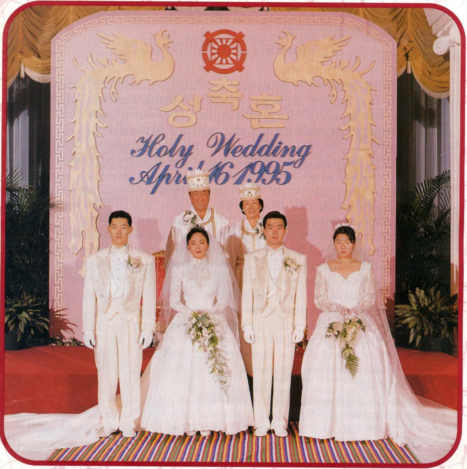
HOLY WEDDING CEREMONY