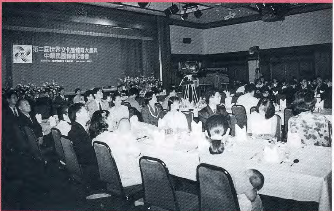
The participants of the press conference watch the video of the 30,000 Couples' Blessing in 1992.

We hope that this is the beginning of a new era. In order to get more people to attend the blessing ceremony, we hope that we can spread the concepts of the blessing all over the country by using the mass media as much as possible. We are planning to stage such a publicity campaign. May God's blessings come to every family. ■